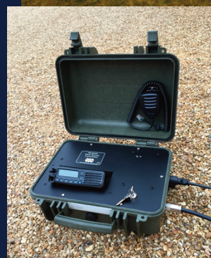
Portable PMR Telemetry with Voice Channel Talkback