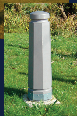
Bollard Housed Sensors