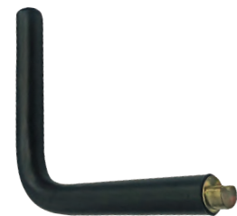
TCOD Key SAFE 7012