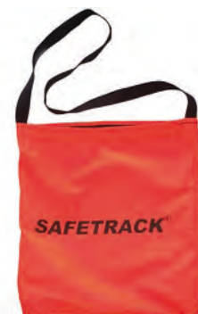
Bag SAFE 7008