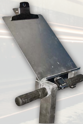
Writing board Part no. 9632