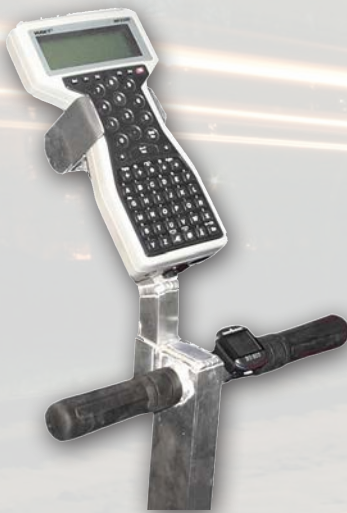
Computer mounting Part no. 9633

Part no. 9628 Loading rack for long instruments etc